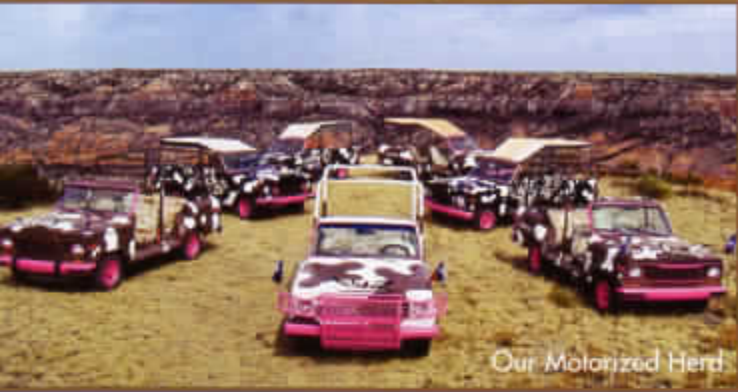
Our Motorized Herd

Come with us on an unforgettable, one-of-a-kind outdoor adventure!