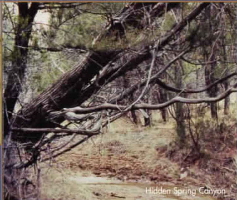
Hidden Spring Canyon

Learn about early cattle ranching and the daily lives of cowboys. Our tour begins over sprawling rangeland and travels through the fun-filled Drunken Drover and Jackrabbit Draws to visit a Century-Old Windmill and the legendary Rustlers' Graveyard . Stop to feed the longhorns along the way. Descend the breathtaking Blindman's Gulch into Hidden Spring , a secluded box canyon, and come upon the Outlaw's Hideout hidden at the base. Follow along the creek as it meanders through a tranquil paradise of wayward trees, wildflowers and ancient towering cottonwoods in this