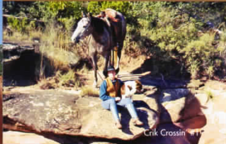
Crik Crossin #11