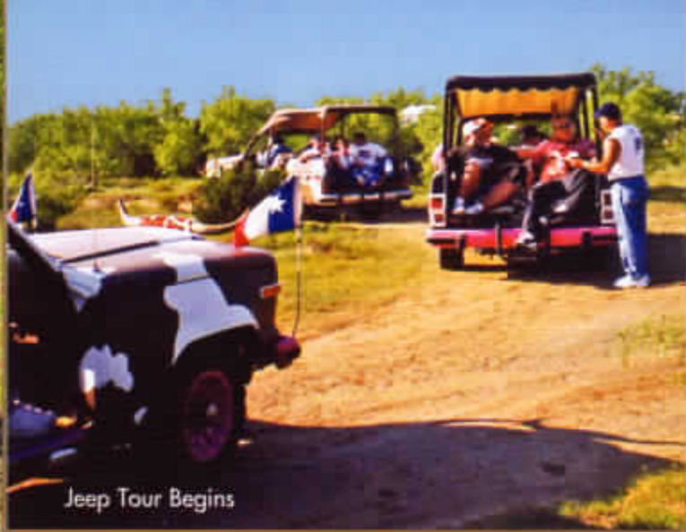
Jeep Tour Begins

Reservations Recommended Tours Offered Year Round (weather permitting) Pets Welcome on Select Tours Wheelchairs Accommodated Prices Subject to Change Sorry, No Credit Cards Group Rates Available