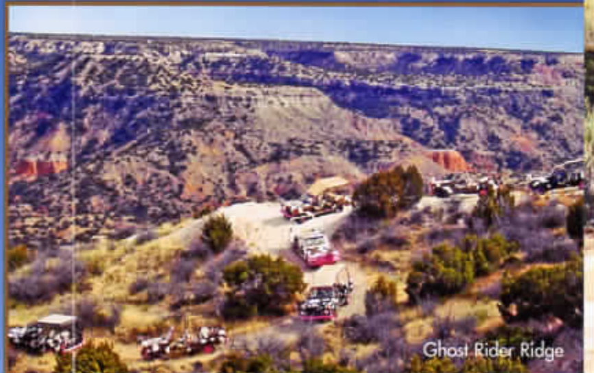
Ghost Rider Ridge

We promise to provide some of the most memorable moments of your vacation!