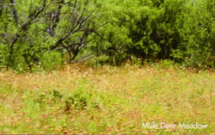
Mule Deer Meadow