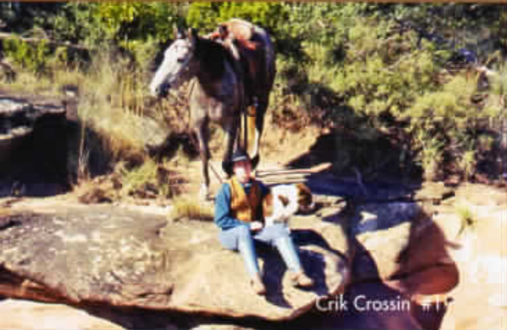
Crik Crossin #1