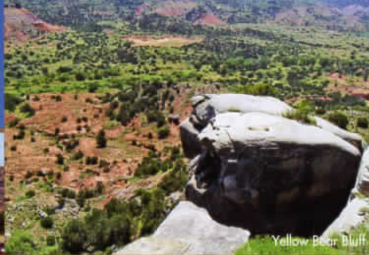
Yellow Bear Bluff