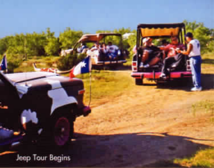
Jeep Tour Begins