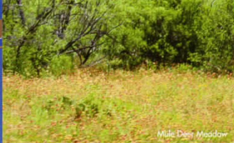
Mule Deer Meadow